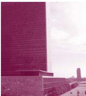
The United Nations Building in New York