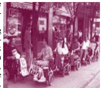
About 30 people protested the lack of a wheelchair-accessible entrance to the Burger King in Downtown El Paso. The protestors said they have asked for a ramp